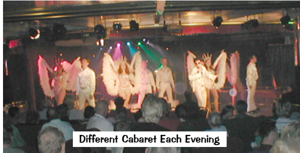
Different Cabaret Each Evening